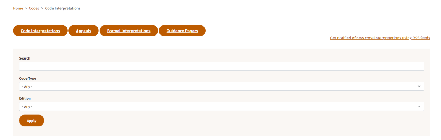
FIGURE 1: NEW LOOK OF CODE INTERPRETATIONS LANDING PAGE