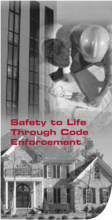
Safety to Life Through Code Enforcement