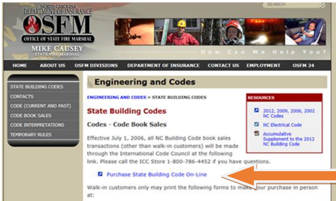
FIGURE 1: OSFM ON-LINE CODE SALES LINK