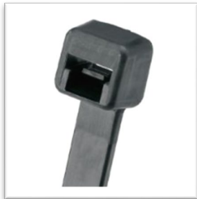
Figure 1: Example of UL-listed Nonmetallic Tie Fastener

NCRC Section M1502.4.2 1 states the exhaust ducts shall be sealed in accordance with NCRC Section M1601.4.1 and shall be mechanically fastened. It prohibits the use of screws or similar fasteners which protrude into the inside of the duct, and it provides two options for mechanically fastening the ducts: nonmetallic mechanical fasteners (tie-straps) that are listed to UL 181B or metal band duct clamps, which are not required to be listed. NCMC Section 504.8.2 also requires mechanical fasteners for domestic clothes dryer ducts, and it requires the ducts to be sealed in accordance with NCMC Section 603.9. Please refer to Figures 1 and 2 for examples of mechanical fasteners below, and Figure 3 for an example of dryer manufacturer installation instructions which require mechanical fastening means.