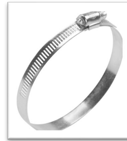
Figure 2: Example of Metal Band Duct Clamp