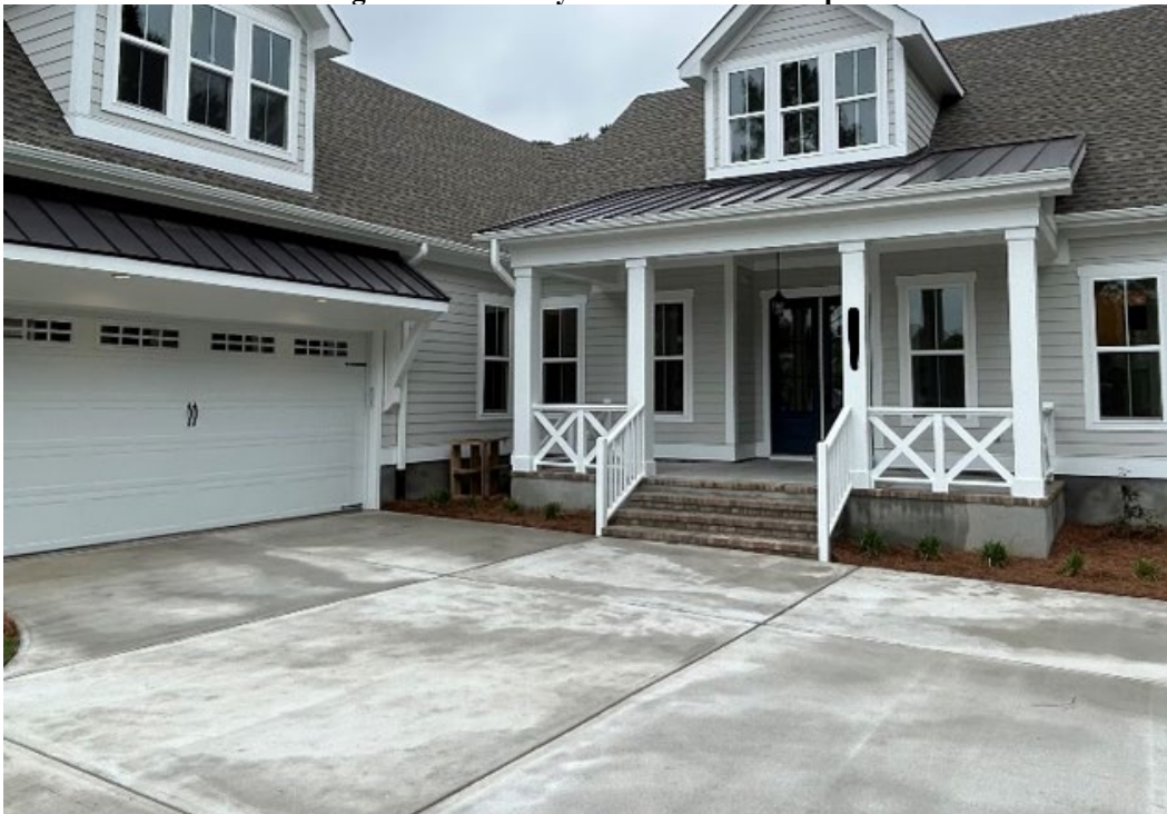
Figure 1: Driveway/Patio with cross-slope

A slope may also be a compound slope, i.e. both a cross-slope and a slope in the direction of travel. See Figure 3 for illustration of a cross-slope. For simplicity, the slope in the direction of travel is not shown.